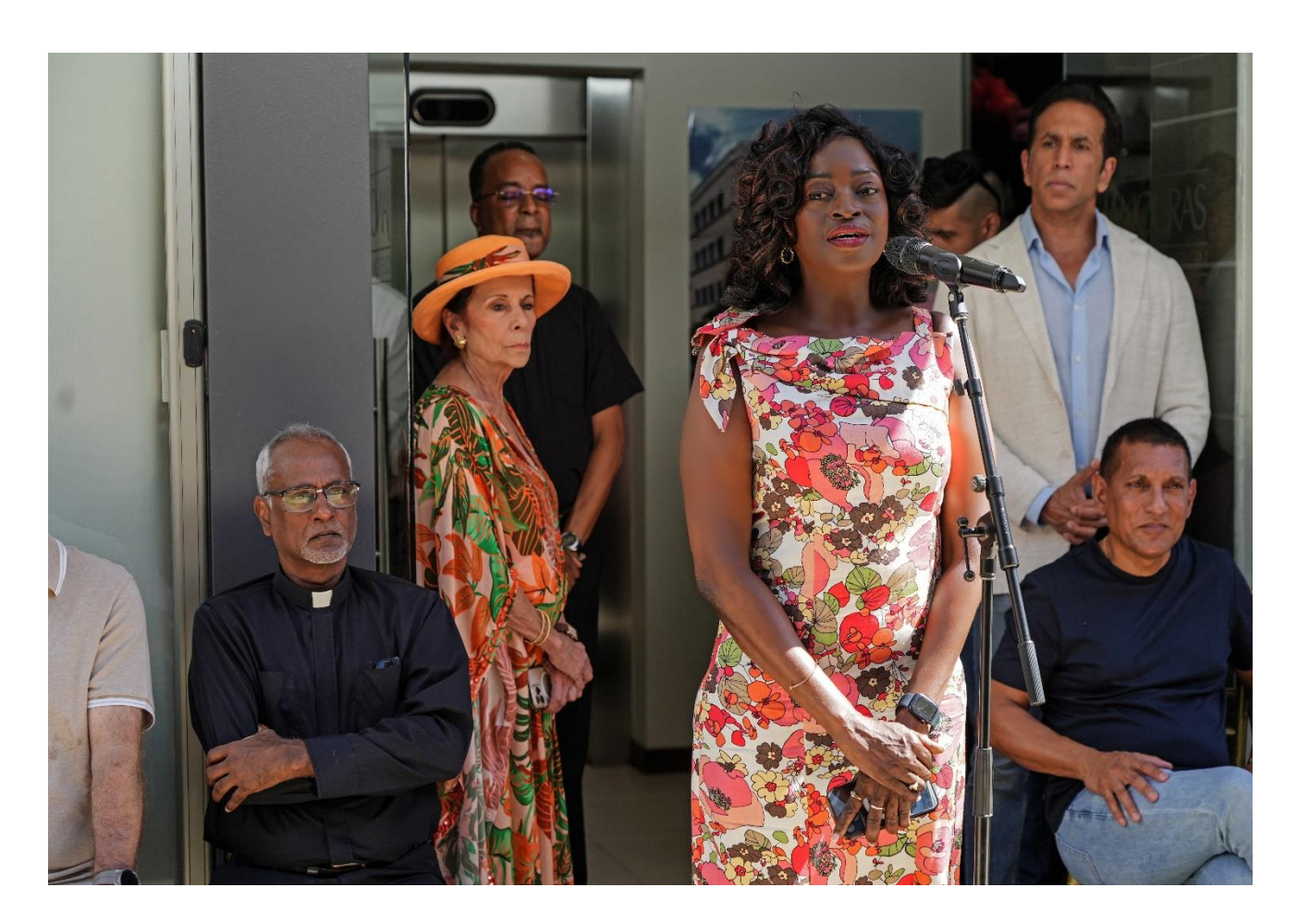
Minister Cox brings greetings at the Wheelchair Distribution hosted by Janouras Custom Design Ltd on Sunday 14th April 2024 in Port of Spain.

Communications Unit Ministry of Social Development and Family Services (868) 623-2608; Ext 5400-5411 <a href="mailto:ceeu@social.gov.tt">ceeu@social.gov.tt</a>