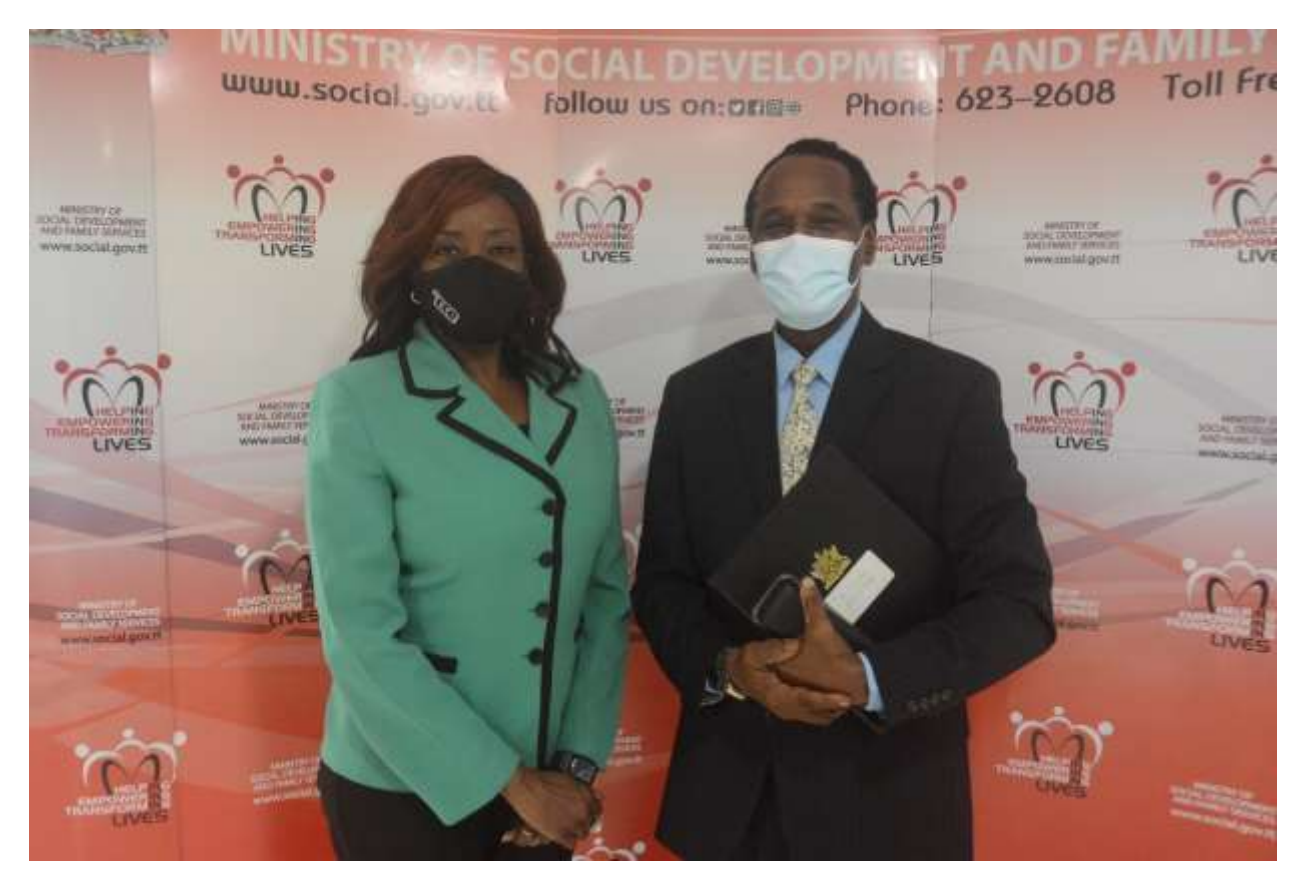
Minister Cox and the Honourable Fitzgerald Hinds, Minister of National Security