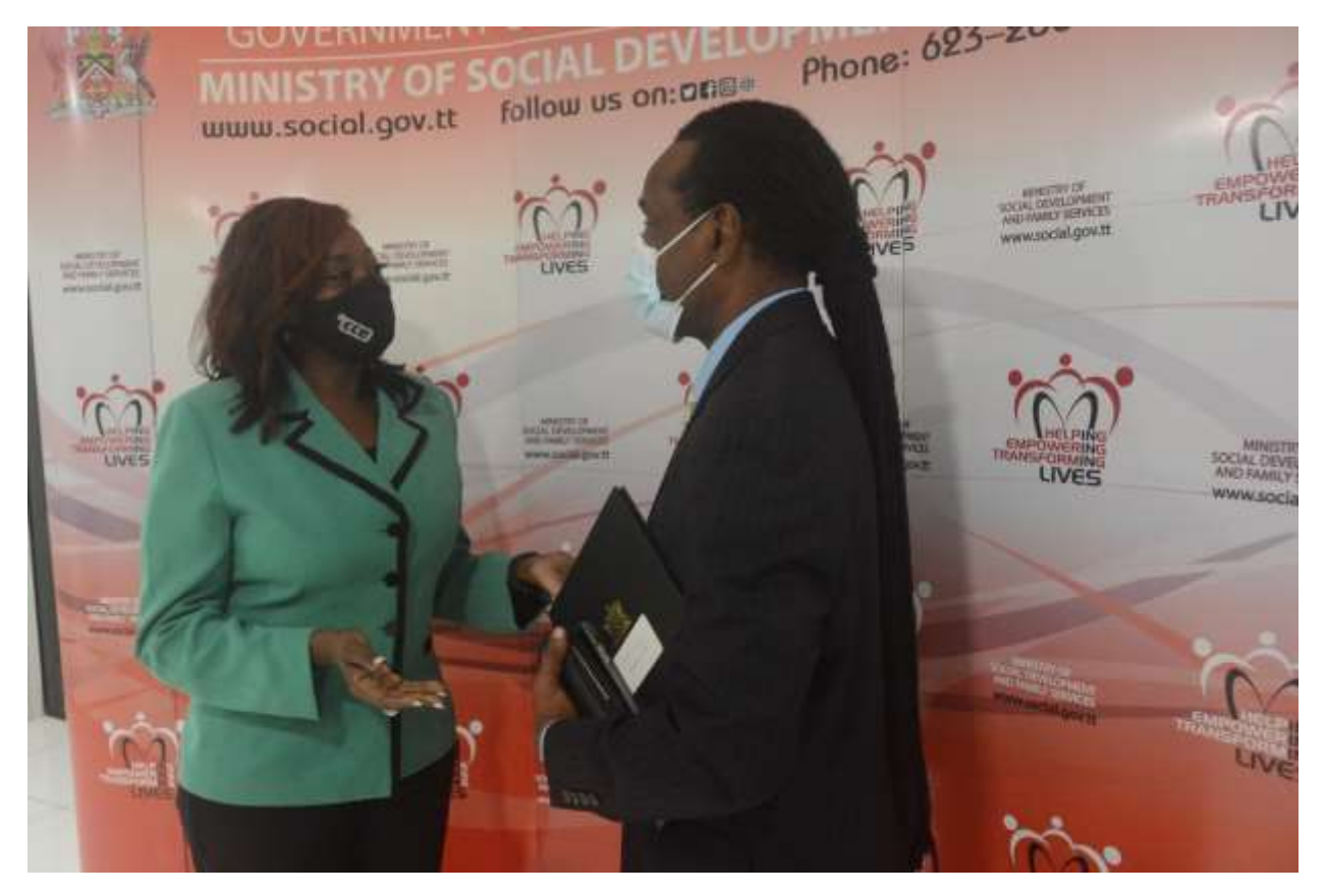
Minister Cox and the Honourable Fitzgerald Hinds, Minister of National Security discuss data exchange after the meeting