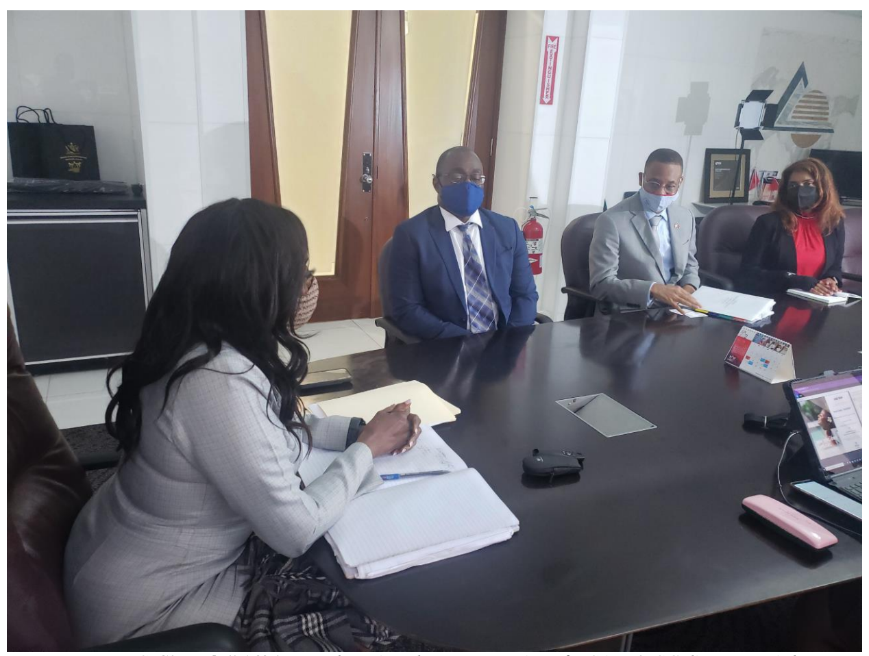
Minister Cox, US Chargé d'Affaires and Regional Representative of USAID/ESC discuss social services.