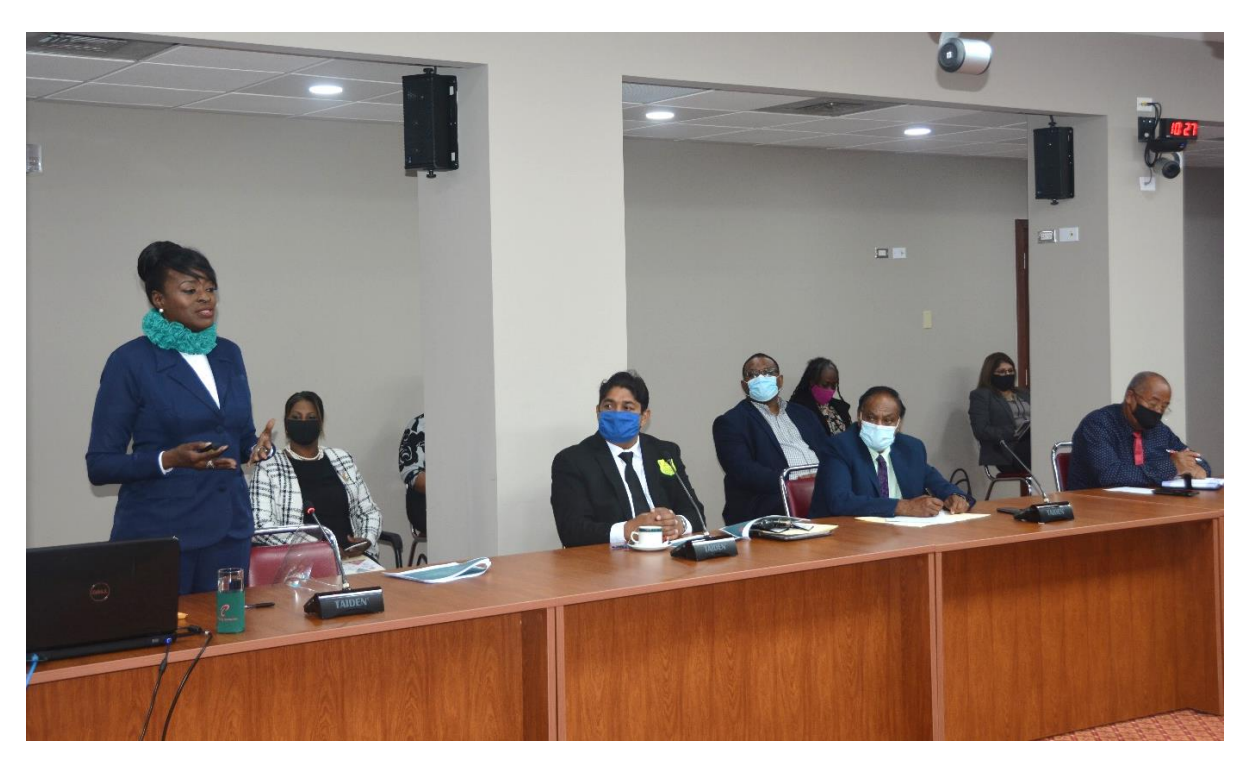
Minister Cox during her presentation on the issue of street dwellers