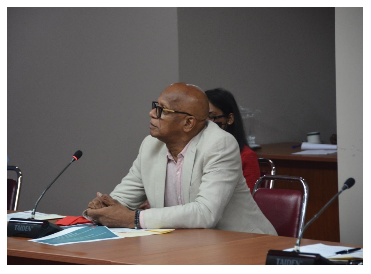
The Mayor of San Fernando, Alderman Junia Regrello highlights San Fernando's efforts towards helping the issue of street dwellers.