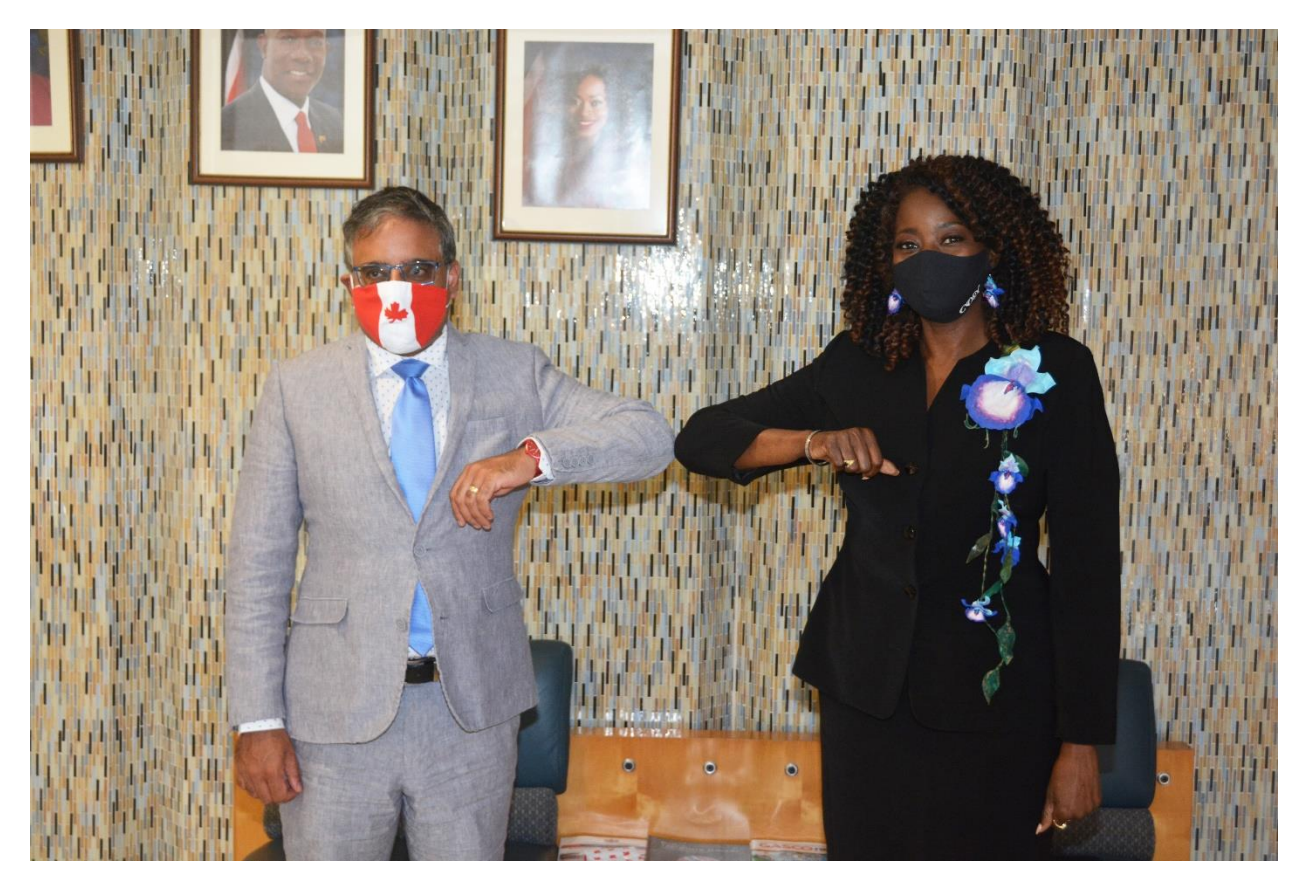
The New Normal - Minister of Social Development and Family Services, Senator the Honourable Donna Cox greets His Excellency Kumar Gupta, High Commissioner of Canada in Trinidad and Tobago.