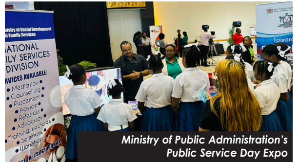
Ministry of Public Administration's Public Service Day Expo