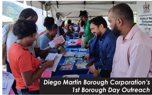
Diego Martin Borough Corporation's 1st Borough Day Outreach