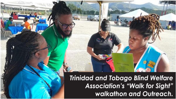
Trinidad and Tobago Blind Welfare Association's "Walk for Sight" walkathon and Outreach.

In 2024, the Ministry of Social Development and Family Services participated in 51 outreaches across Trinidad, reaffirming its commitment to reaching the population and disseminating vital information about available grants, services, and programmes.