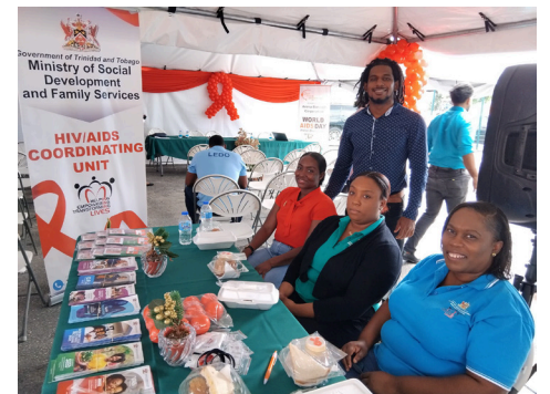
MSDFS Staff participate in an Outreach in commemoration of World AIDS Day hosted by COM Talk International in collaboration with the Arima Borough Corporation