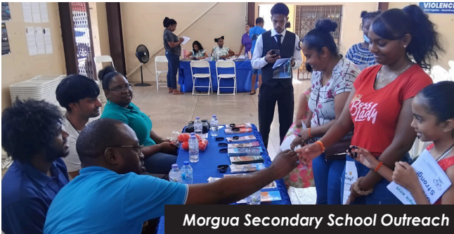
Morgua Secondary School Outreach