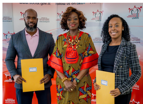
Minister Cox presents Instruments of Appointment to two members who will serve as government representatives to the Board of the Trinidad and Tobago Blind Welfare Association (TTBWA)