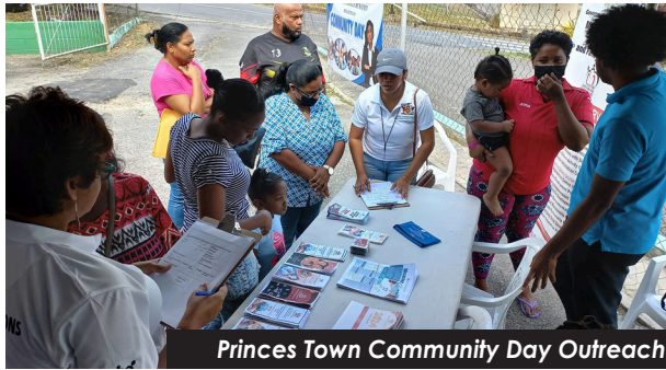
Princes Town Community Day Outreach