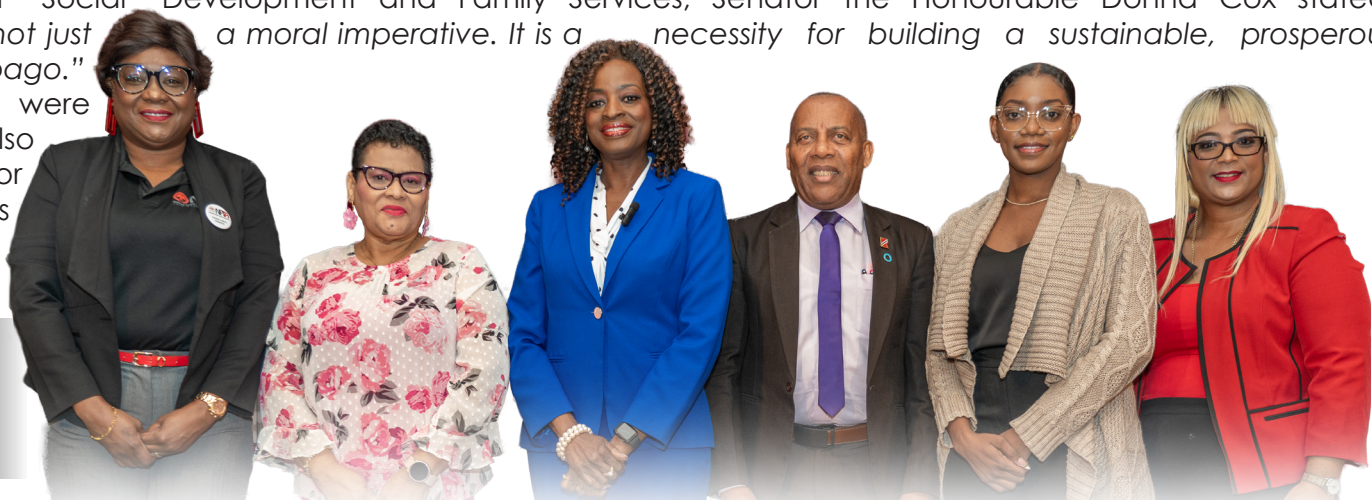
Minister Cox with Representatives of the National Parent Teachers Association at the launch

The Ministry of Social Development and Family Services (MSDFS) launched its 2024/2025 edition of the National Parenting Programme. Minister of Social Development and Family Services, Senator the Honourable Donna Cox stated, "Strengthening families is not just a moral imperative. It is a necessity for building a sustainable, prosperous future for Trinidad and Tobago." The Parenting Workshops were not only informative, but also served as a catalyst for positive change in the lives of families, and by extension, our nation.