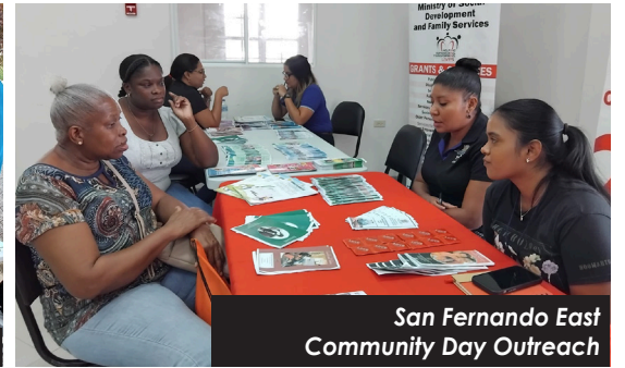
San Fernando East Community Day Outreach