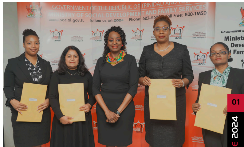
MINISTER COX AND RECENTLY APPOINTED MEMBERS OF THE BOARD OF THE TRINIDAD AND TOBAGO BLIND WELFARE ASSOCIATION (TTBWA).