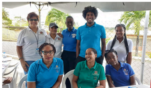
Outreach supported by MSDFS Staff