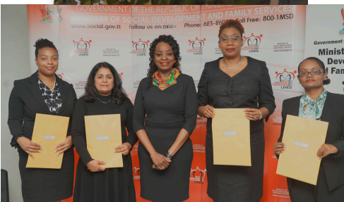
Newly appointed TTBA Board