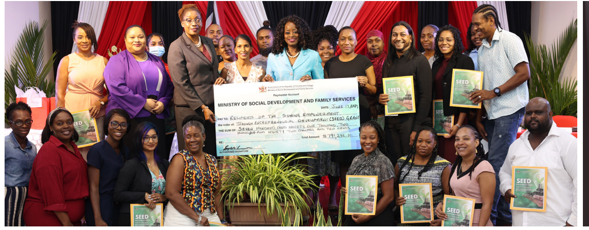
Minister Cox, executive, staff and SEED grant recipients pose for a photo following the distribution held on June 17, 2024.